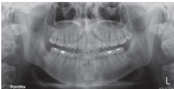
The Paniramic image in previous time

Easily shown clear and high quality image when the luminous body absorbed X-ray, the each cell converts Electronic signal without any spread and overlap.