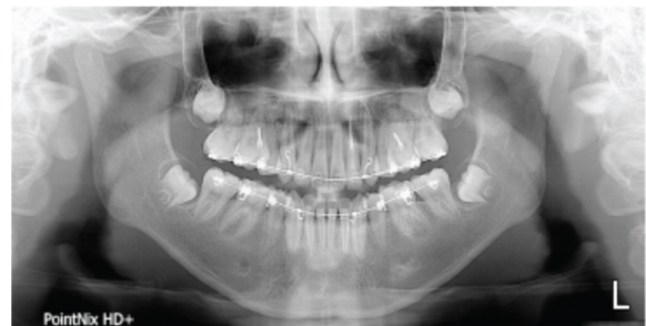
The Paniramic image currently